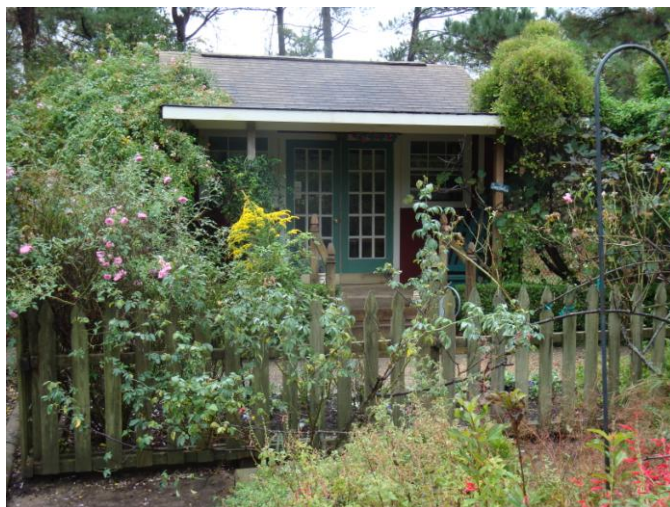
Mary Wark's kitchen in the garden