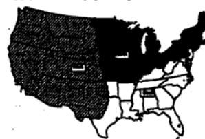
Table 1 NORTH/SOUTH REGION ANNUAL WEED CONTROL—TOUCHDOWN 5 HERBICIDE RATES

Use the higher end of the rate range when stressful growing conditions or dense plant populations exist.